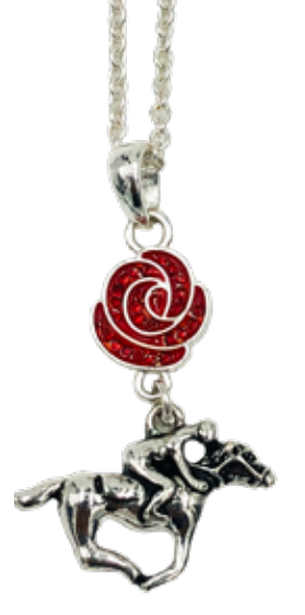
Derby Icon Rose Race Horse Necklace 06-0171 $19.99