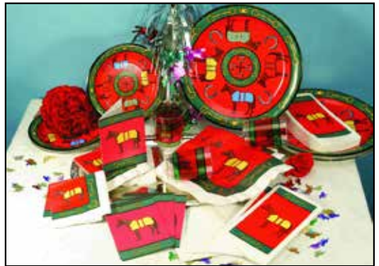
"Horse with Blanket" Series Dinner Napkins 24 per pkg. 45-0003 $5.00 8" Paper Plates 10 per pkg. 45-0004 $5.00 12" Paper Plates 10 per pkg. 45-0005 $7.00 Original art by J .Andrew Biesel

Beverage napkins 24 per pkg. 53-0002 $4.25 24 per pkg. 53-0003 Dinner napkins $5.00 10 per pkg. 53-0004 8" paper plates $5.00 53-0008G $6.00 Table cover Disposable paper with plastic liner. 54" x 102" Original art by J .Andrew Biesel