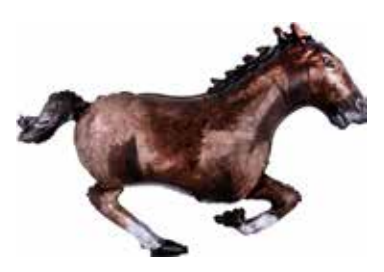
Galloping Horse Silhouette Balloon 40". 550082 $15.99