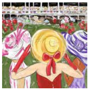
Derby Hats Festive Beverage Napkins 24 per pkg. 37-0102 $5.99 Luncheon Napkins 37-0103 $6.99 Beverage 35-0102 $5.99

Bourbon & Bluegrass Julep Candle A rich woody and musk base with a fusion of herbs and amber. 6 oz. 3.5" comes with cloth protective bag. 80-0007 $29.99