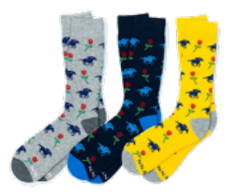
"Victory Rose" Sock Men's Size 7-13 $18.00 per pair 07-0003G Heather Gray 07-0003 Navy 07-0003 Yellow