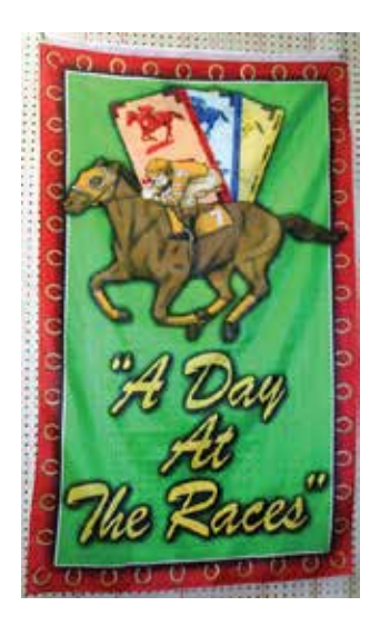
" A Day at the Races" Flag" 36" x 60" nylon. 55-0613 $16.99

Racehorses Table Cover 4.5' x 9' plastic cover printed with vibrant graphics. 57-0618 $8.99