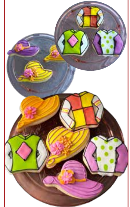
3 1/2" Old Fashioned Sour Cream Cookies (family recipe). All dressed up for the Derby. Individually wrapped. Derby Hat 22-0011 $3.99 Jockey Silk 22-0012 $3.99 Dozen 22-0013 $45.00