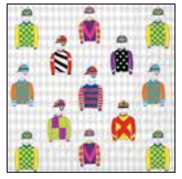
Multi Jockey Silk Luncheon Napkins 20 per pkg. 35-0103 $6.99

Bourbon & Bluegrass Julep Candle A rich woody and musk base with a fusion of herbs and amber. 6 oz. 3.5" comes with cloth protective bag. 80-0007 $29.99