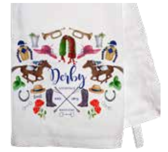
Anatomy of the Derby Bar Towel 100% cotton, machine washable with loop for easy drying. 33-0444 $19.99