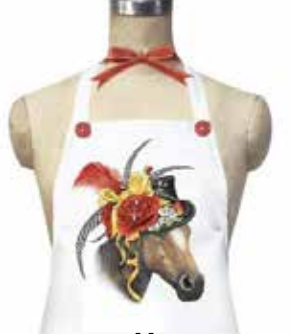
Fancy Horse Hat Apron 31-0026 $29.99