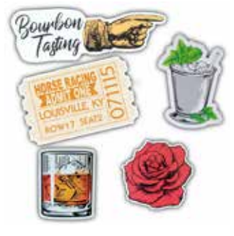
Nostalgic Style Vintage Derby Cutouts 6 cutouts. 3" x 7" 55-062 4 $8.99