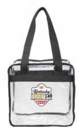
Kentucky Derby Clear Zippered Tote Bag PVC 12" x 4" x 12" 49-0129 $19.99