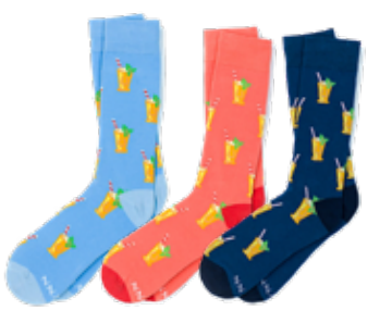
"Mint Julep Please" Men's Sock Size 7-13 $18.00 per pair 07-0004 Blue 07-0004 Coral 07-0004 Navy