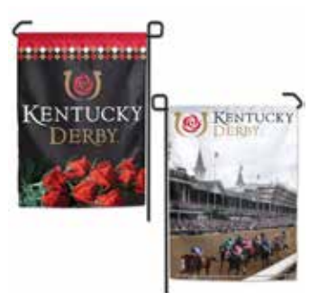
Kentucky Derby Garden Flag Two-sided 12 ½" x 18" 29-0122 $16.99

Churchill Downs Stadium Wool Banner 15" x 20" 29-0131 $50.00