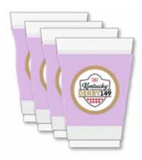
Frosted Cups 14 oz. 10 per pkg. 49-0106 $14.99