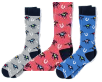
"Talk Derby to Me" Sock Men's Size 7-13 $18.00 per pair 07-0015G Gray 07-0015PB Blue 07-0015P Pink