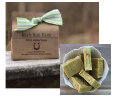
Mint Julep Soap Herbs grown on KY farm, handcrafter by KY artist. 31-0093M $7.99