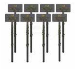
Swizzle Sticks 8 per pkg. 29-0013 $7.99