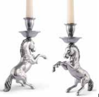
Rearing Horse Candlestick 55-0172 $64.00