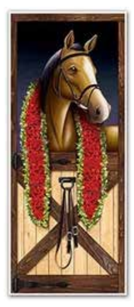
"Proud Winner" Door Cover 40" x 60" indoor/outdoor plastic cover. 55-3386 $15.00