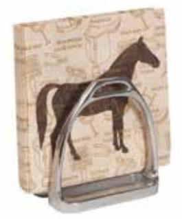
Equestrian Stirrup Napkin Holder 5" H x 3.5" W x 4.5" L. 28-134H12 $54.00