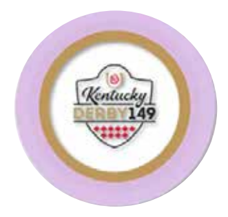
9" Paper Plates 20 per pkg. 49-0105 $7.99