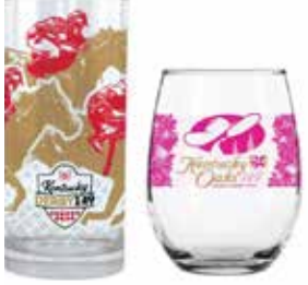
Kentucky Derby Glass plus Oaks Lilly Glass Set 13-2023DO $19.99