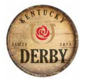
Kentucky Derby Icon Round Wooden Sign 14 ½" x ¼" 49-0607 $20.99