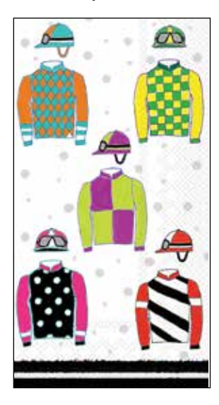
Multi Jockey Silk Guest Towels 16 per pkg. 35-0104 $7.99