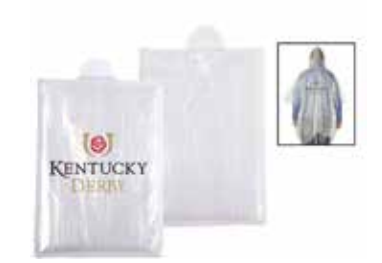
Derby Rain Poncho 29-0126 $5.99