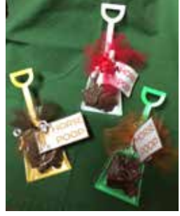
"Horse Poop" with Shovel, $5.99 each Henrietta Horse Lime with cookies and cream bark. 21-0211 Lime "Which way did they go" Ambling Henry Yellow with chocolate & Toffee Bark 21-0211Yellow Ronnie Race Horse White with Rocky Road 21-0211 White

"Joey" Prancing horse cake topper. 7" wide x 7.5" tall. 56-0614 $6.99