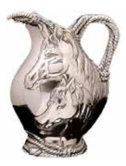
Horse and Rope Pitcher 30-0102 $149.00