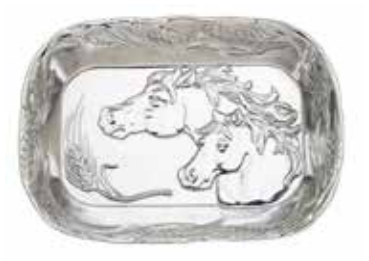
Horse Catch All 47130 $28.00