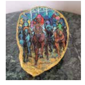
Racing Decoupaged Oyster Shell with They're Off Design. Nice hostess Gift or decorating Accessory. 490018 $24.99