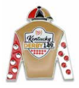
KD 149 Jockey Silks 49-0902 $7.99