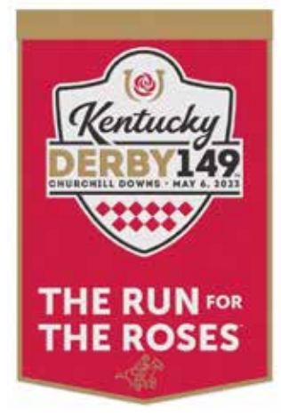
Kentucky Derby 149 Wool Banner 24" x 38" 49-0601 $69.99