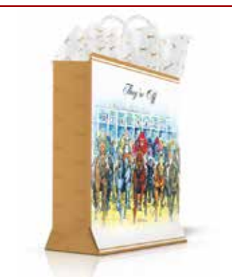
They're Off Gift Bag 8" x 4" x 10" 49-0015 $5.99