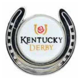
Lucky Horseshoe With Derby icon. 49-0903 $7.99